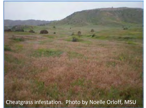
Cheatgrass infestation.

Cheatgrass ( Bromus tectorum ) is one of the most significant invasive plants in the western U.S. and Canada where it currently infests over 100 million acres. The most extensive infestations have historically been in the Great Basin, but its distribution has been expanding in Montana, Wyoming, Colorado, and southern Canada as well. Because cheatgrass often forms extensive infestations of hundreds to thousands of acres, biological control is an attractive option. Below is a summary of three naturally occurring soil borne organisms that are being researched as potential biological control agents. These organisms are under development and not yet commercially available. However, you may be familiar with them due to recent media coverage (first two discussed below) or first-hand experience (third discussed below).