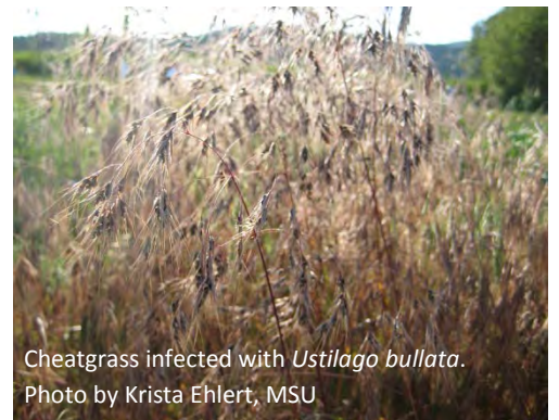
Cheatgrass infected with Ustilago bullata .

Ustilago bullata Ustilago bullata , or head smut, is a fungal pathogen that results in cheatgrass producing black, powdery smut in place of seeds, thereby reducing or even eliminating seed production of affected populations. This organism has not received as much attention as the two described above. However, you may be most familiar with this organism because it is commonly encountered in the field, showing up as black powder that covers your pants and shoes when you walk through a patch of infected cheatgrass.