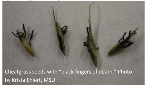
Cheatgrass seeds with “black fingers of death.”

Pyrenophora semeniperda Pyrenophora semeniperda is a fungus that infects seeds in the soil seed bank. This is in contrast to P. fluorescens strain D7 which affects seedlings that have already germinated from seeds. The fungus has been nick-named “the black fingers of death” due to black, finger-like growths that occur on the seed. Cheatgrass is a prolific seed producer and accumulates thousands of seeds in the seed bank; one of the appeals of P. semeniperda is that it can reduce seeds in the seed bank. This is appealing for situations where cheatgrass forms solid stands and revegetation is required, but seeded species must compete with cheatgrass seedlings emerging from the seed bank. While P. semeniperda has been found to infect the seeds of grass species other than cheatgrass (it is a “generalist”), research has shown that seeds of desired grasses can be protected with a fungicidal seed treatment. The application of P. semeniperda has been tested primarily by researchers in Utah, Idaho, and Washington. Studies are also being conducted at Montana State University as well.